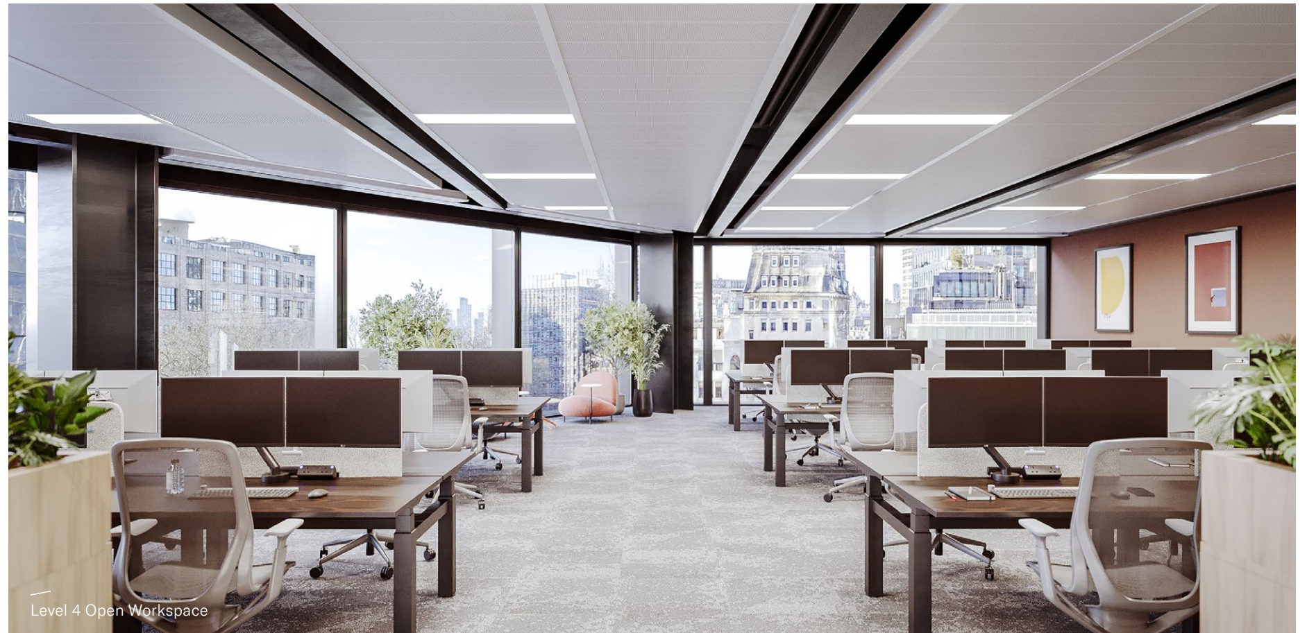
Level 4 Open Workspace