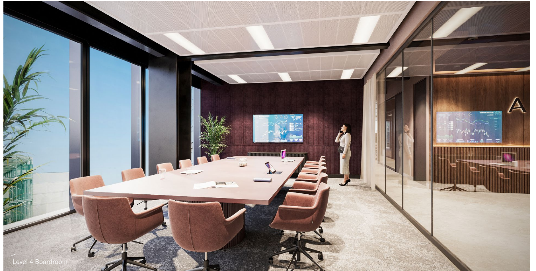
Level 4 Boardroom

Utilising recycled and recyclable materials