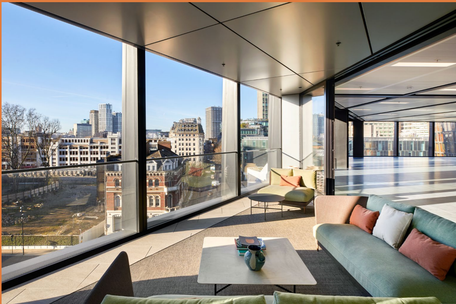
Typical floor terrace

Test space plan for illustrative purposes only.