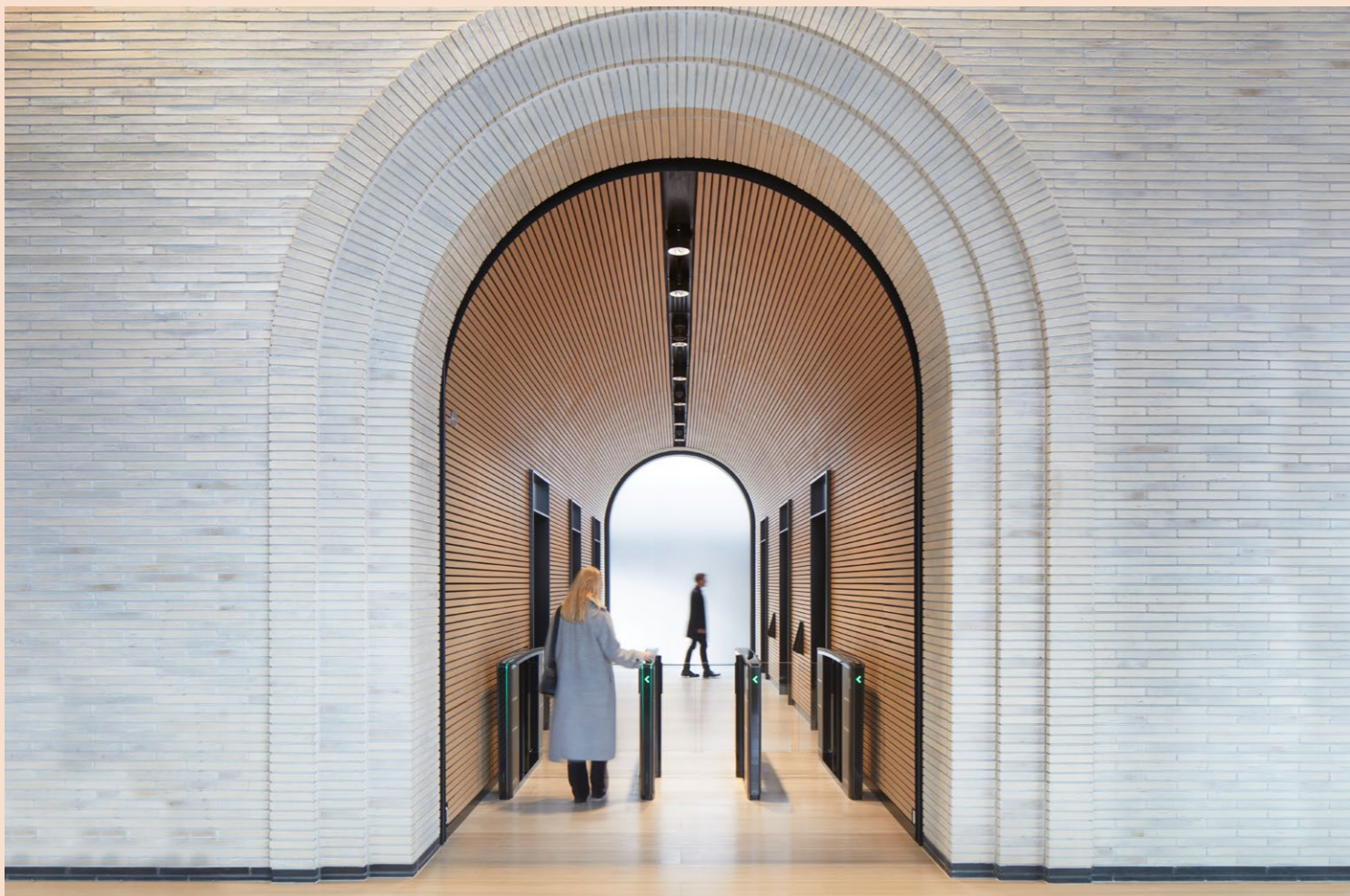
Lift lobby on Level 1